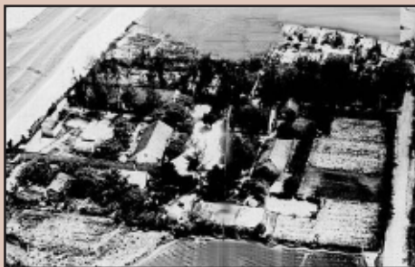
Aerial photo of Son Tay prison camp in 1970.

A task force of Army and Air Force volunteers, led by Col. Arthur "Bull" Simons, executed a daring plan to rescue prisoners of war at the Son Tay prison camp near Hanoi, Vietnam. One helicopter purposely crash-landed inside the camp while other helicopters land just beyond the perimeter. The assault team