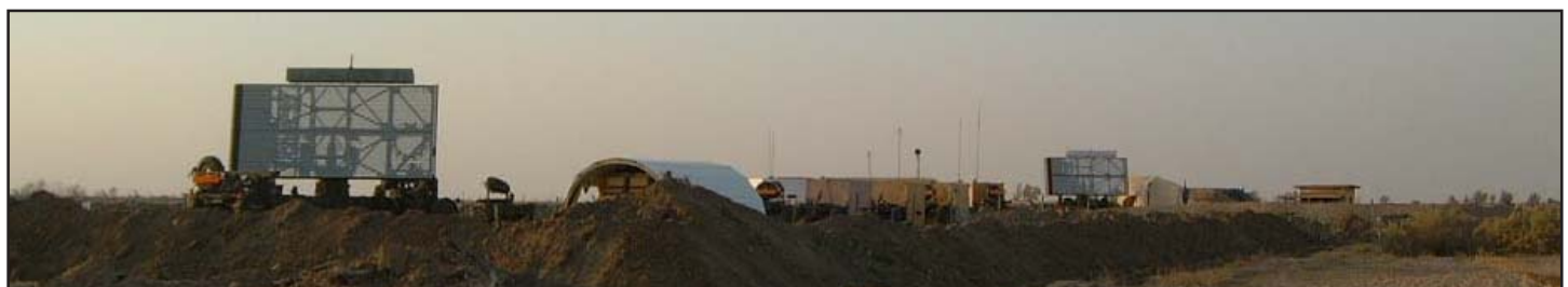
▲ HOME ON THE RANGE: The No. 1 Air Control Centre houses the communications professionals deployed to Tallil Air Base as part of Operation TELIC.